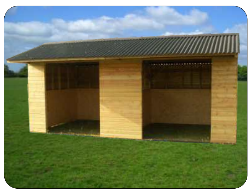
10' x 20' (3.0 x 6.0m) Double Mobile Field Shelter with optional Canopy & Divide